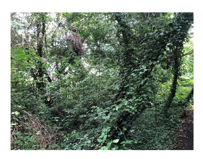
Large oak tree on subject land. Boundary of subject land runs from fence to the left of the tree up to the left edge of the firepit/benches (approx.)